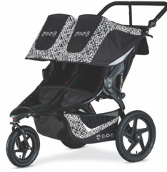
Lunar Black U231950