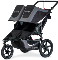
Graphite Black U231947