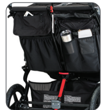
10 Storage Pockets