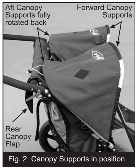
Fig. 2 Canopy Supports in position.