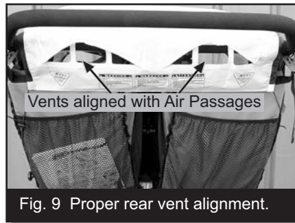
Fig. 9 Proper rear vent alignment.