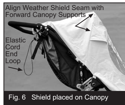
Fig. 6 Shield placed on Canopy