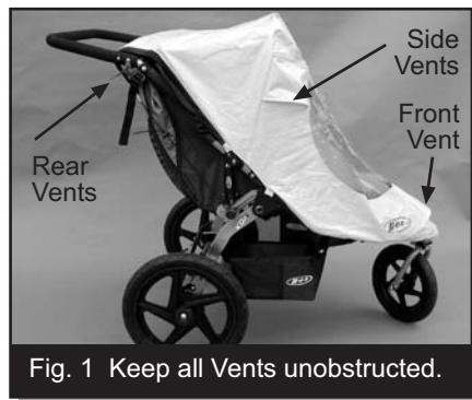
Fig. 1 Keep all Vents unobstructed.