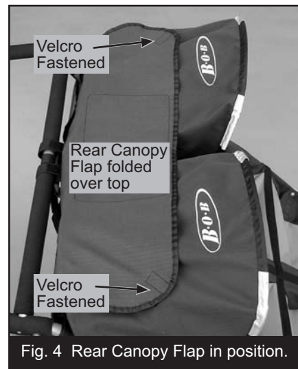
Fig. 4 Rear Canopy Flap in position.

6. Stretch the elastic cord on each side under each respective black shock knob as shown in Fig. 7. There is an opening mid way up each side (with silver