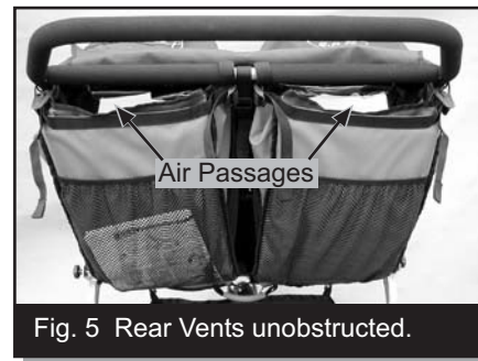
Fig. 5 Rear Vents unobstructed.