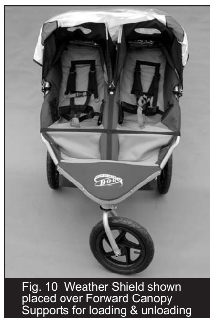
Fig. 10 Weather Shield shown placed over Forward Canopy Supports for loading & unloading