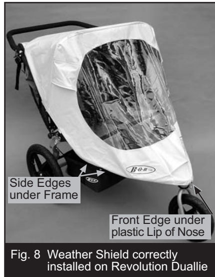
Fig. 8 Weather Shield correctly installed on Revolution Duallie

12. Once your child is secured in the safety harness (refer to your stroller Owner's Manual, Seat Safety Harness section), release the Weather Shield from canopy and re-secure under the lip on the stroller nose and under frame sides. Fig. 8 shows a Revolution Duallie Weather Shield